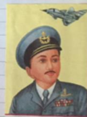
SOLDIER (AIR FORCE) सैनिक (वायु सेना)

On 24 th Feb 2018, we went to school picnic to Air Force Museum. We saw fighter planes of India. We had also seen some missiles. We had seen some destroyed fighter planes of Pakistan also. Some small planes were also kept in microcos. We did pictures also with Indian fighter planes. There we saw some other people also. We had seen so many guns also. And some awards also. We had seen Martyrs of 1965 and 1971 also. I felt so proud to see all these things. We love our Air Force Unit. And my this experience was very good.